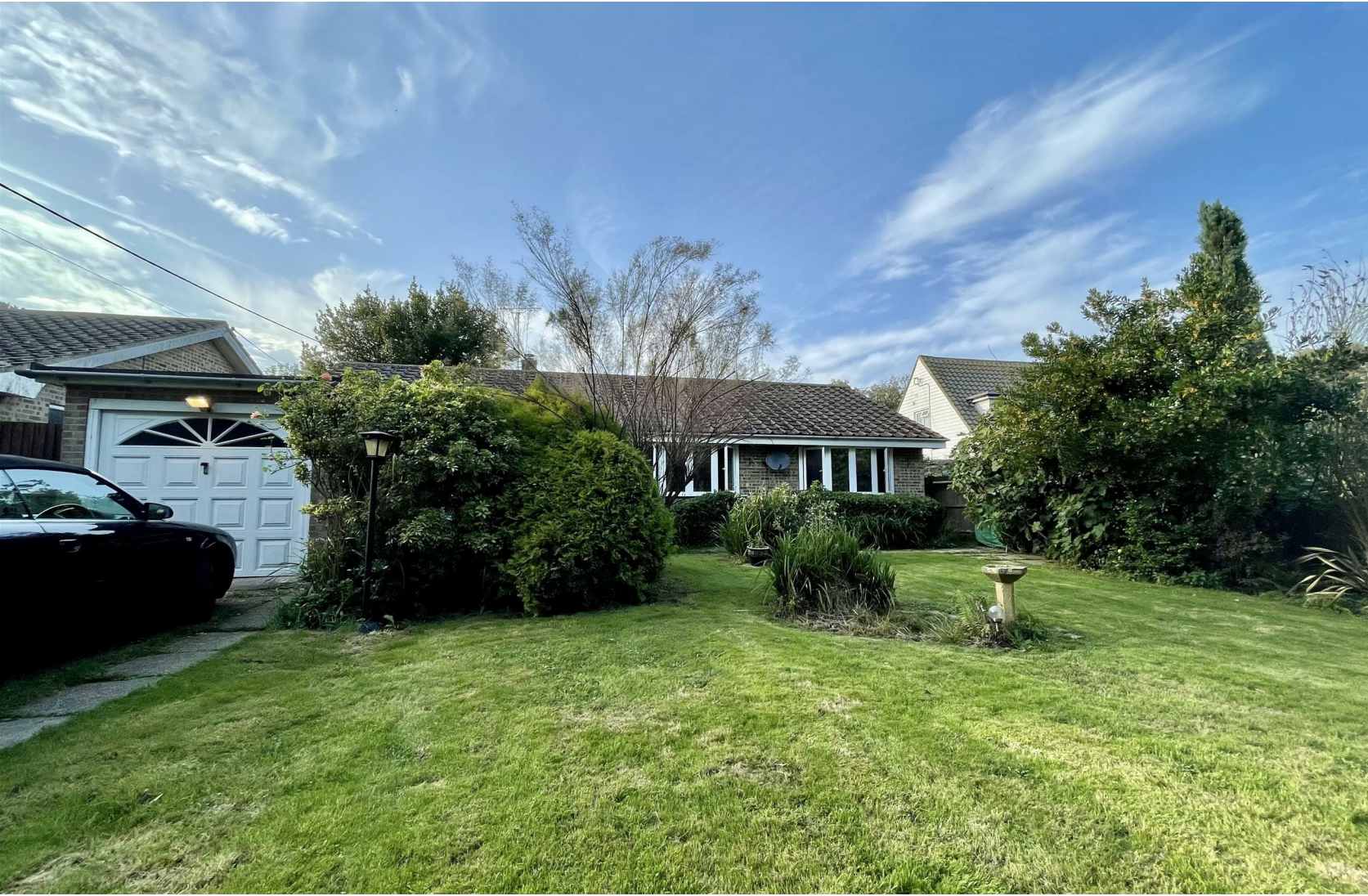
Fig Tree Cottage 53 Lower Waites Lane, Fairlight, TN35 4DD